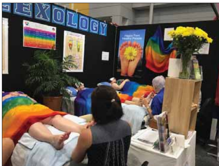
Queensland Reflexology Association members at Mind Body Spirit in February.

This event provides the Association with a significant income and gives us as therapists the opportunity to educate many people about the benefits of reflexology.