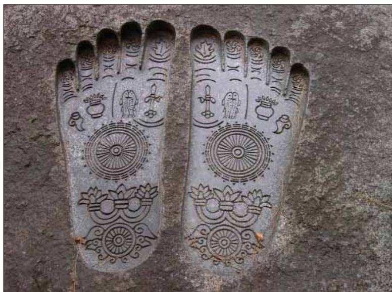
Buddha's soles are an iconic symbol, reminding us there is a spiritual path to follow. This image appears on a rock in Kyoto, Japan

Jung C (1995). Memories, Dreams and Reflections . Fontana Press, London.